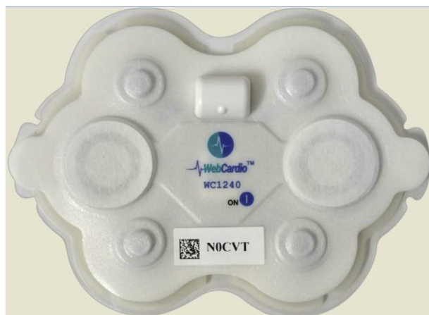
Fig. 1. The patch used in WebCardio system.

The study was conducted in the department of cardiology of